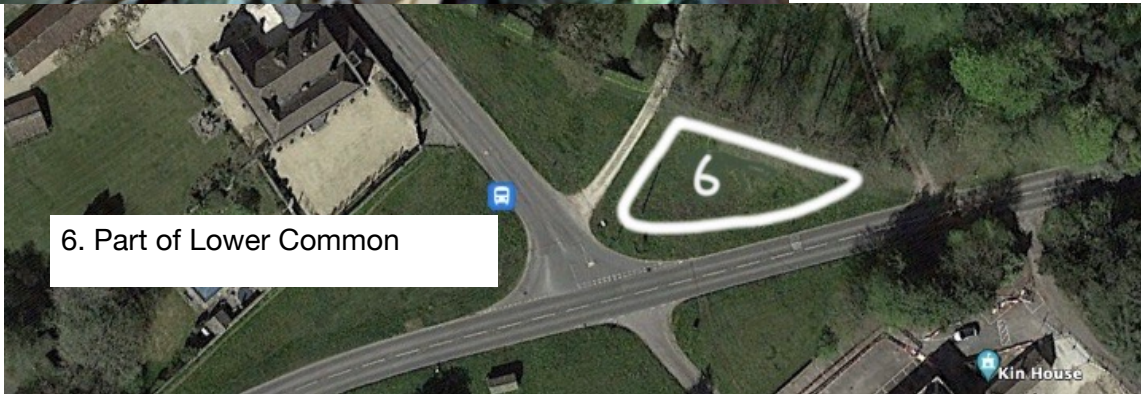
6. Part of Lower Common