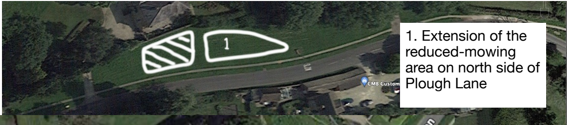
1. Extension of the reduced-mowing area on north side of Plough Lane