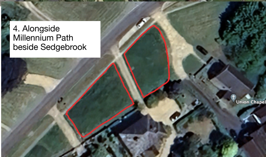
4. Alongside Millennium Path beside Sedgebrook